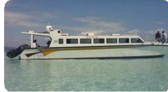
For 21-25 pax, Engine 3x250 HP