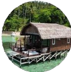
4 Deluxe Room: AC, Priv.