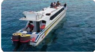
For 12-16 pax, Engine 2x250 HP