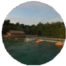
Sea Front, Beach, Snorkeling/Diving Area