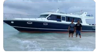
For 26-30 pax, Engine 3x300 HP