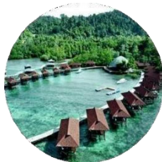
21 Ocean Room: Over Water Cottage, AC, Priv. Bathroom, TV, Balcony