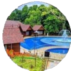
Swimming Pool, Snorkeling/Diving Area, Kayak/Kano