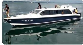
For 16-20 pax, Engine 2x250 HP