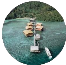
Over Water Cottage, Snorkeling/Diving Area Bathroom, TV, Hammock