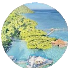
Location on the heart of Raja Ampat, Snorkeling/Diving Area, Kayak/Kano