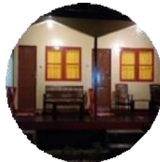
10 Superior Room: AC, Priv. Bathroom, Garden View 3 Deluxe Room: AC, Private Bathroom, Sea Front MUST UPGRADE/ADDITIONAL