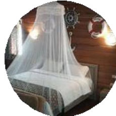
8 VIP Room: AC, Priv. Bathroom, TV, New & Spacious (ALL DOUBLE BED ROOM)- MUST UPGRADE/ADD